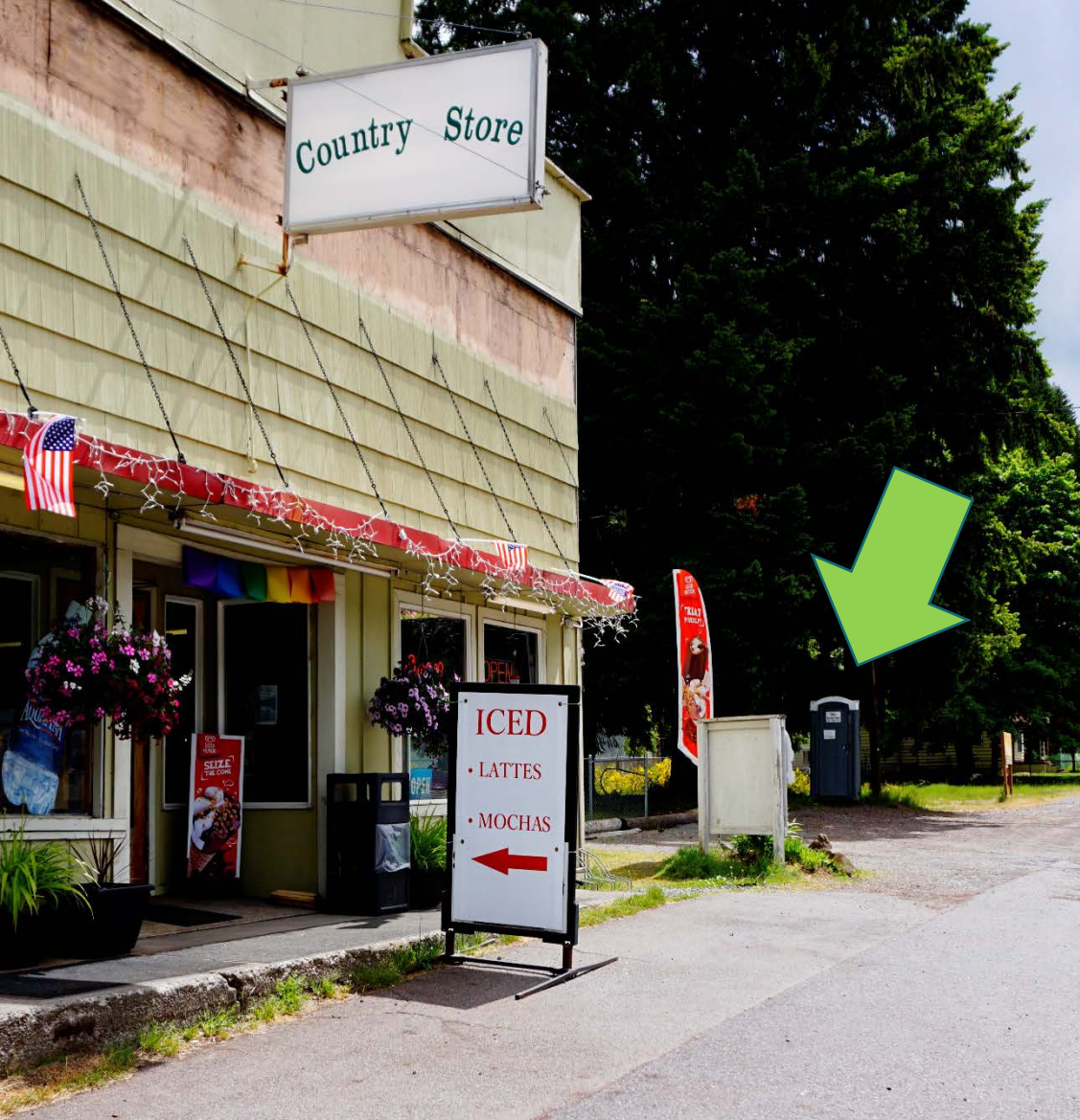
Idanha, Oregon Population: 140